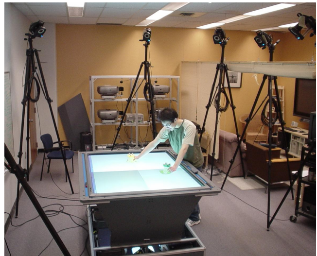
Figure 4. The user is holding two physical objects to interact with the virtual entities displayed on the SMART board. The board is surrounded by six Vicon motion tracking cameras for locating the reflective markers attached on top the objects to approximate their positions on the table.

We intend to use small dog-shaped toys as Ricons TUIs for controlling the real AIBOs. By placing reflective markers on top of these toys, we will be able to use the Vicon MX system [21] to keep track of the Ricons' locations on a SMART board [19]. (Figure 4) As the users move the Ricons around on the board, the information provided by each robot will be displayed and follow along with the Ricons.