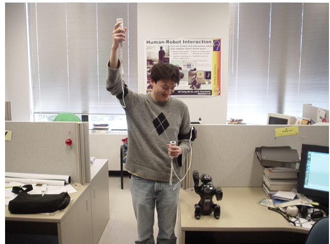
Figure 2. The user is controlling the AIBO to perform a posture using one Wiimote and one Nunchuk on each arm.

Due to the nature of the tasks, the Wiimote & Nunchuk gesture-to-action mappings deployed in each task differ from each other in terms of “degree of integration” and “degree of compatibility”. [13] The interface mapping for the navigation task has a less than one degree of integration and a low degree of compatibility, where the interface mapping for the posture task has a close to perfect degree of integration and a high degree of compatibility.