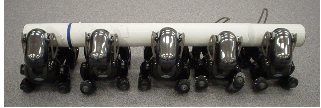
Figure 3. A conceptual design of a simple collaborative task among AIBOs carrying an object from one location to another.

To simulate a robot collaboration task in a lab setting, we intend to use five to eight AIBOs as the robotic platform for performing a set of collaborative tasks. For instance, the robots will be placed in a particular formation to carry or pull a heavy object together from one place to another. (Figure 3)