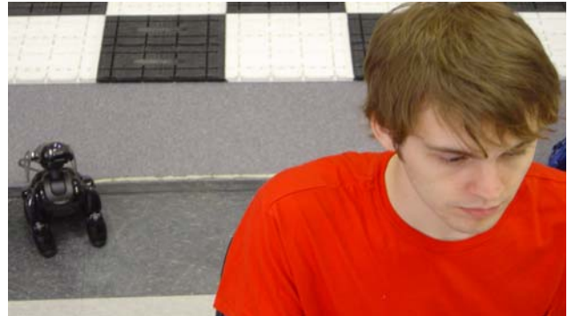
Figure 3. How AIBO Surrogate appears in the real world

The walk control , shown at the bottom of the tooltip grande as blue crosshairs and a robot dog icon, lets the person control the robot's movement. Clicking left or right of center controls how quickly the robot turns left or right. Clicking above or below the center controls how quickly the robot walks forward or backward. Clicking the center tells the robot to stop moving. Thus the controller can make the AIBO walk and turn in any direction by clicking and holding on a desired position. Control feedback of the current walk parameters is provided by the robot icon snapping to the mouse position and following the mouse as it moves. The robot maintains the target speeds until the person