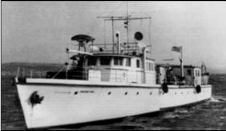
Figure 1: The MV Christmas Seal , as seen leaving Port de Grave on its last trip as an X-ray clinic, Oct. 1970.

One of the greatest battles ever to take place in Newfoundland took almost hundred years to resolve. In that time no shots were fired, no blood spilled, no bands headed long lines of marching troops, and no troopships plied the seas. The battle was fought right here against an invisible enemy who attacked young and old alike. A microscopic scrap of life was the enemy, for it was a virus, spread from one person to another that made tuberculosis a dreaded killer. 1