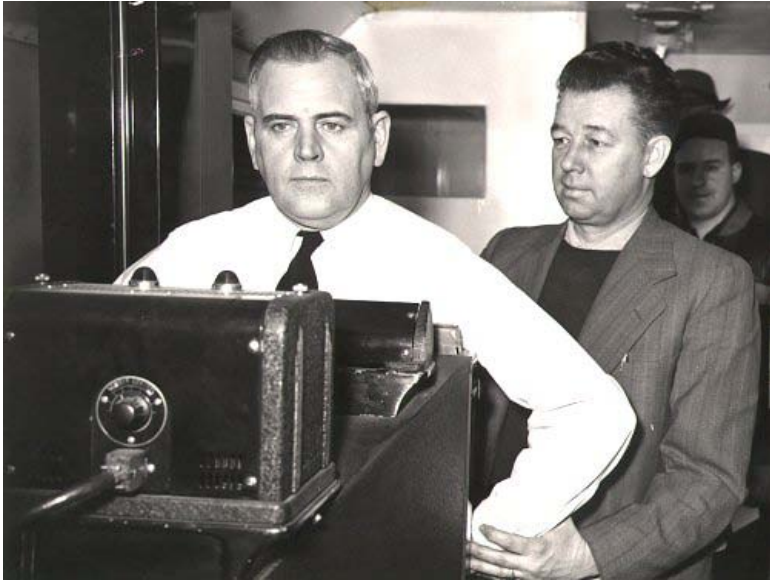
Figure 4: A man being X-rayed during a community survey. As the surveys progressed, they became more efficient; as seen here, participants were eventually able to remain fully clothed during the X-ray.

for Diabetes Mellitus Type II), a physiotherapist and social worker from the Newfoundland Society for Crippled Children and Adults. 28