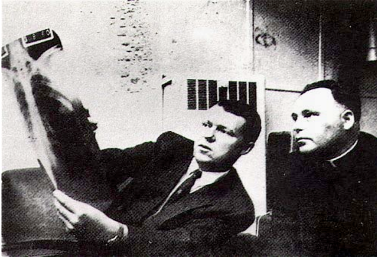
Figure 3: A Doctor onboard the MV Christmas Seal , interprets an X-ray in the summer of 1954.

X-rays being taken, often more than one X-ray per minute. 25 Those patients who were called back for a second X-ray were seen by the doctor who would read the film in the boat lounge. When active TB was found, arrangements had to be made immediately for admission to a sanatorium. 26